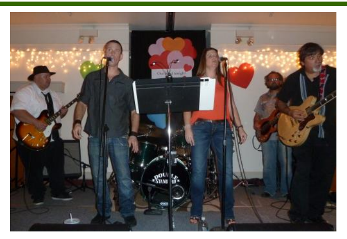
Dance music by Double Standyrd